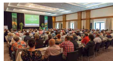
Representatives from the national federations and the local authorities as well as town planners etc. took part in the 4th federal congress