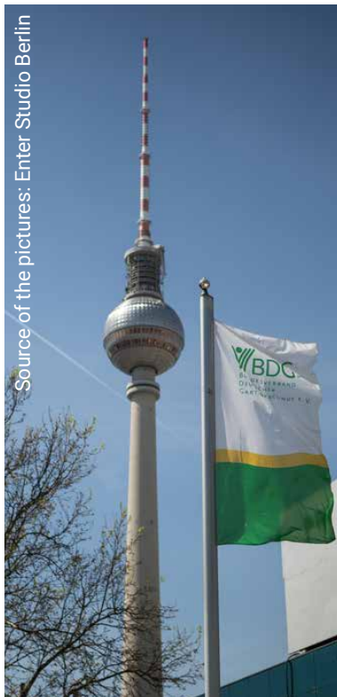
The allotment gardeners met in the center of Berlin near the television tower

President of the German allotment federation