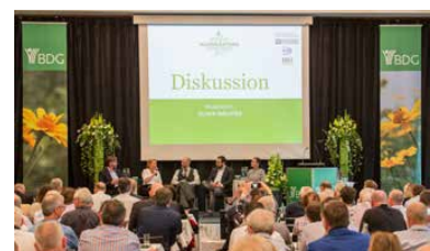
Politicians discuss the issues concerning the allotment movement