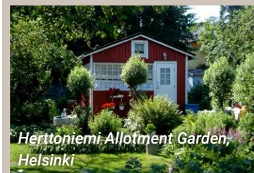
Herttoniemi Allotment Garden, Helsinki