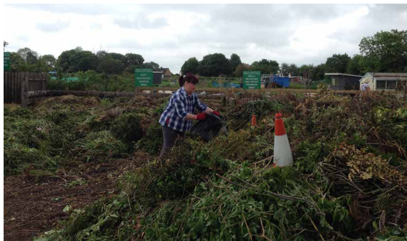
Member brings woody pruning to the bays before shredding and sorting by volunteers and part time labour.

Allotment holders never have enough good compost! In Bisley we solved our problem by initiating a COMMUNITY COMPOSTING SCHEME.