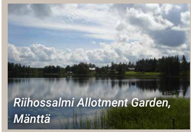
Riihossalmi Allotment Garden, Mänttä