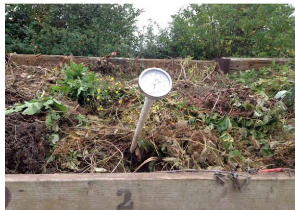
A compost bay ‘in progress’ with thermometer.

Amazingly we are still hugely enthusiastic (mad as hatters), happy that our scheme not only helps keep allotment soil healthy, but also is clearly appreciated by the whole community.