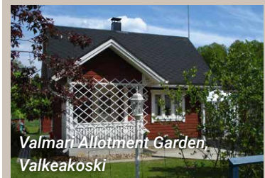
Valmajärvi Allotment Garden, Valkeakoski