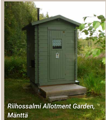
Riihossalmi Allotment Garden, Mänttä