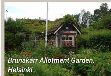
Brunakärr Allotment Garden, Helsinki