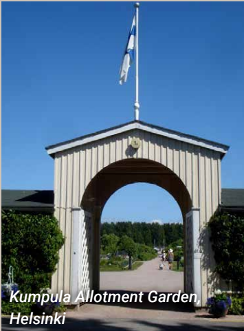
Kumpula Allotment Garden, Helsinki