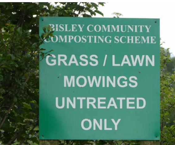
3 signs telling members where to put various materials.