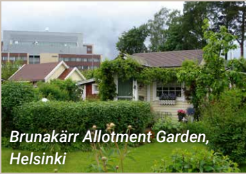
Brunakärr Allotment Garden, Helsinki