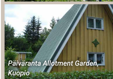
Päiväranta Allotment Garden, Kuopio