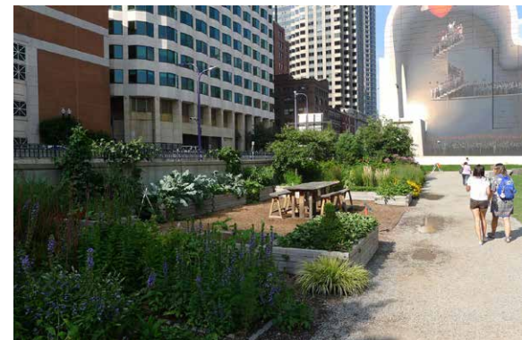
Edible gardens in the public green zones in Boston.