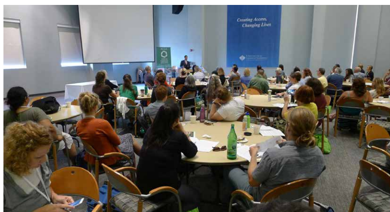
Lectures, working groups, discussions