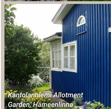
Kantolanniemi Allotment Garden, Hämeenlinna