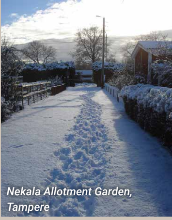
Nekala Allotment Garden, Tampere

The area near the eastern border may receive ten times as much snow as the west coast, thanks to the continental climate. Winters are harsh, summers can be hot and dry. In the east the soil is often poor.