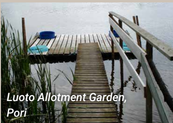
Luoto Allotment Garden, Pori