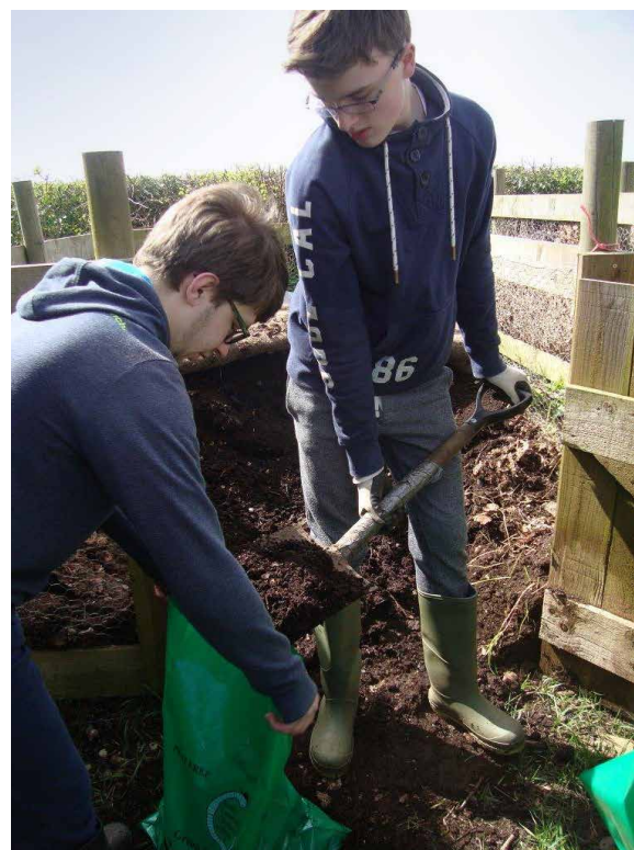
Horticultural Students from Thomas Keble Secondary School fill bags with leaf mould.

http://www.bisleycommunitycompostscheme.org.uk