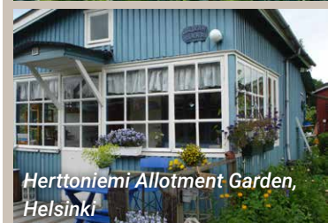
Herttoniemi Allotment Garden, Helsinki