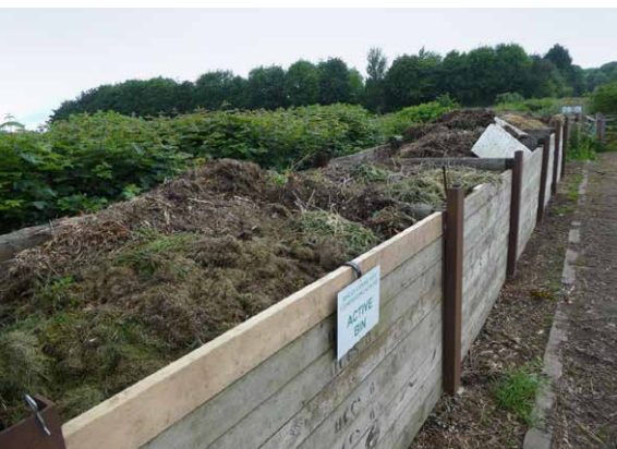
Bins layered but before 1st of 2 turnings - shows layering of brown shredding and green lawn mowing.