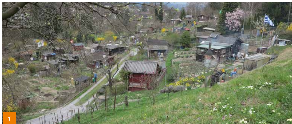
Foto1: The allotment site Wehrenbach in Zurich

On the site itself there are several parts which are too steep for gardening. Natural meadows have been growing here since time immemorial, some of which are covered with fruit