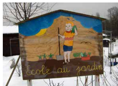
Bourget et Bourget-école sous la neige

Additionally, many societies participate in festivities and events organised by their commune, as for exam-