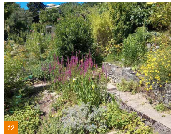
Foto 12: Cultures, perennials, woody plants, wild plants, paths, walls, open spaces... Garden area on the site of Wehrenbach, Zurich

Foto 11: Creation of a support area for wild bees